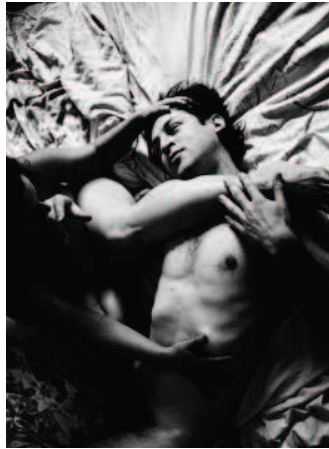
Anders Petersen. Close Distance. 2002